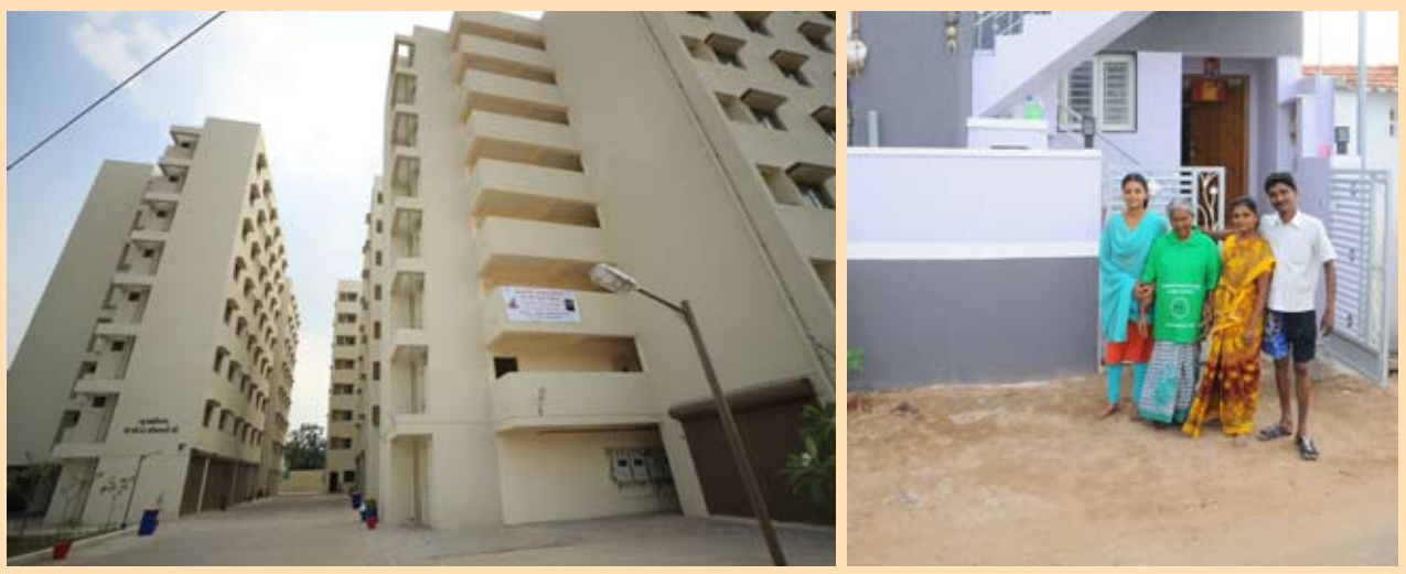
Completed project in Ahmedabad, Gujarat under In-Situ Slum Redevelopment (ISSR)

If required, these models may be tweaked to suit the State Governments requirements to promote public private partnership (PPP) in a big way to fulfill the Mission objective. In these models, public land has been used as a resource to cut down the cost or cross-subsidise the cost of EWS/LIG houses or allowing deferred payment (as annuity or hybrid) to bring down upfront burden to the State exchequer.